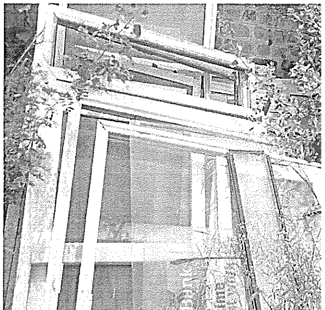
Scrap Yard -D