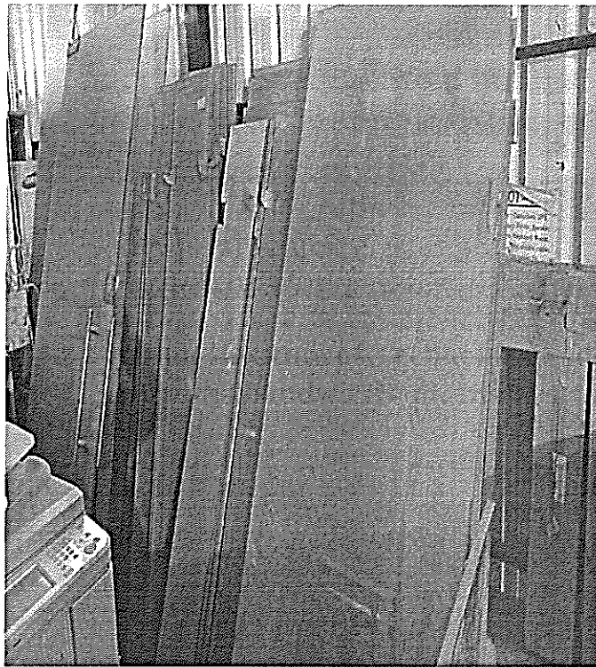
Office Back side-A

Tel.: 07324-660/3413/3551 Email: mms@iiti.ac.in